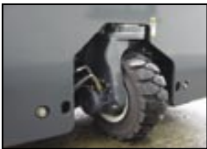
The C4000E has a single rear wheel providing excellent manoeuvrability.