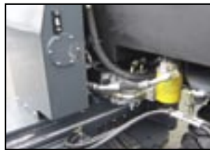
The hydraulic pump connected to the electric motor powers the drive wheels and the hydraulic functions.