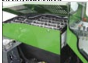
The battery compartment on the C4000 Electric.