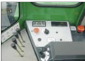
The operator compartment on the C4000 Electric.